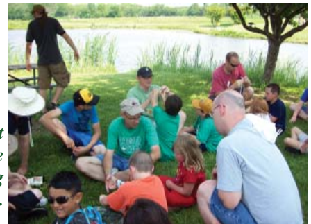
Learning to set up the line at the “Fishing Basics” station.